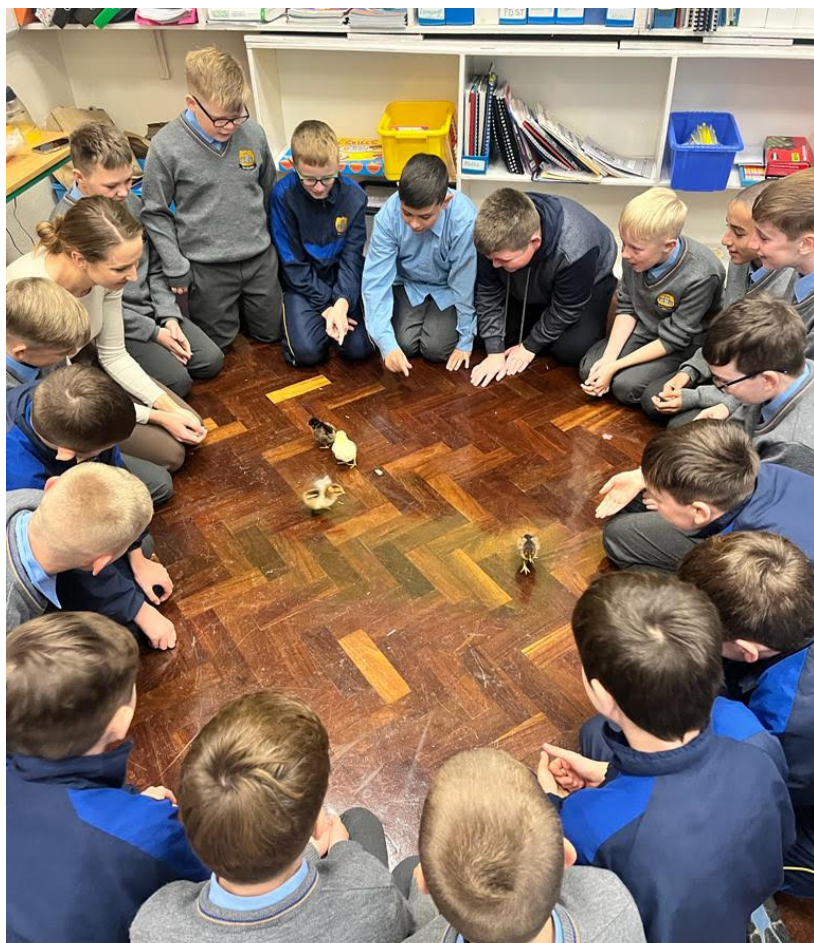
We've been watching our four chicks - Patrick, Bob, Yellow Belly and Sylvester II-hatch, grow and run around Room 16