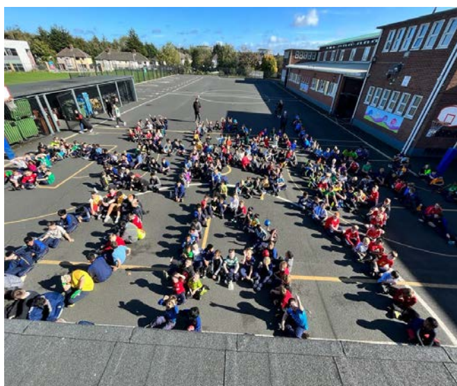
We raised an incredible €463 for the charity Goal