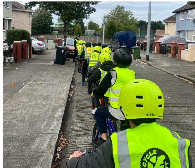
6th Class Cycling Programme