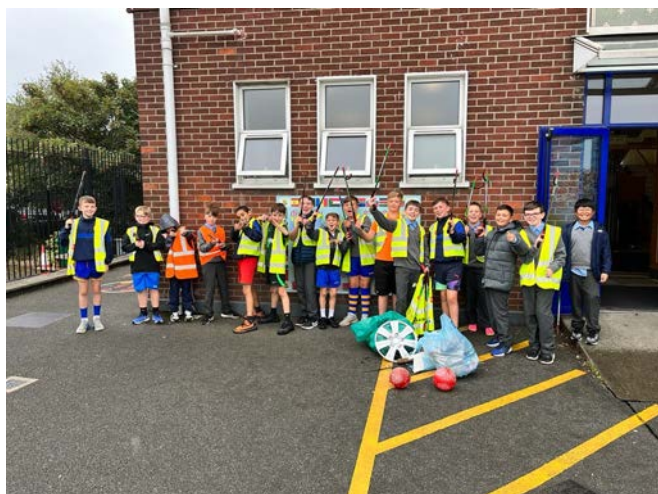
We often go litter-picking to keep our school grounds and neighbourhood clean