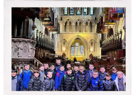
ROOM 13 IN ST.PATRICK'S CATHEDRAL