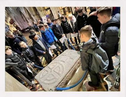
ROOM 13 IN ST.PATRICK'S CATHEDRAL